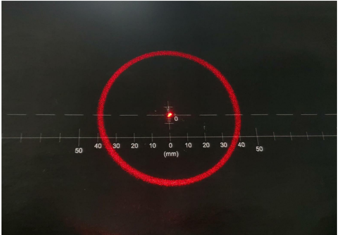
LM9R635S5P37 Beam Shape at 1m